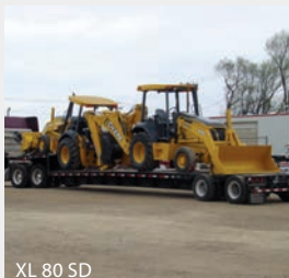
XL 80 SD