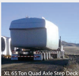
XL 65 Ton Quad Axle Step Deck

Featuring 80K webs and T-1 flanges , the XL SD is designed to withstand years of usage. XL's one-piece construction process results in stronger products. I-beams are made from one piece web and flange and then welded on all sides.