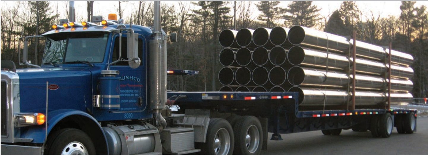
XL 2 Axle 70 Step Deck