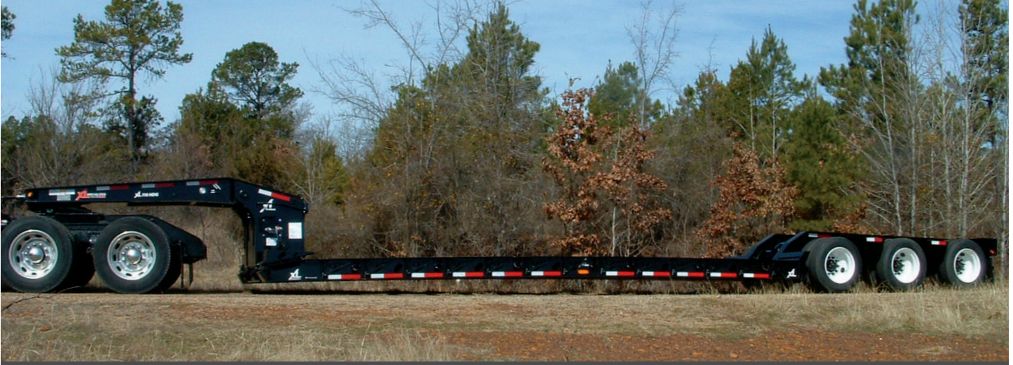
XL 110 Low-Profile Hydraulic Detachable Gooseneck: 18" Deck Height