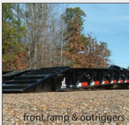
front ramp & outriggers

The 18" loaded deck height lowers loads to meet bridge clearance heights without needing a drop-side or beam deck. This trailer is equipped with a lowered bolster height for a lower machine height when loading over the rear. The full 26' in the well provides ample room for heavy equipment.