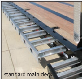
standard main deck

The XL aluminum pullout outriggers are the ideal solution for hauling wide wheeled equipment. They extend to 27" on 18" centers with 4,400 lb capacity per aluminum extrusion. XL pullout outrigger tubes have cleanout holes to prevent rust and keep the bottom of the trailer free from dirt and debris.