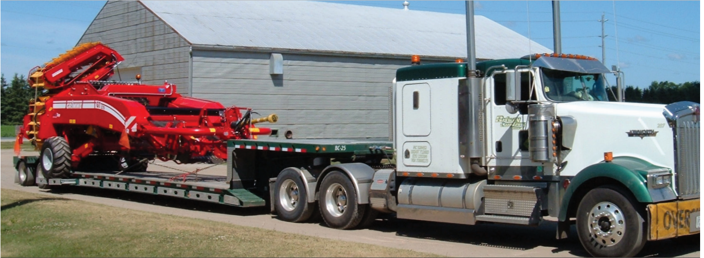
XL 70 MFG with aluminum pullouts